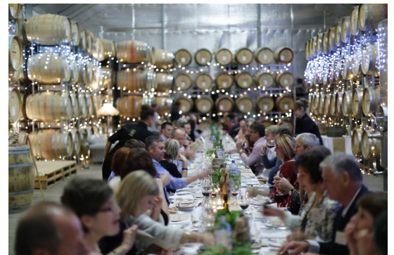
Dutschke Unearthed – May 2013

Back in May 2009 we held our very first Dinner in The Shed, with around 45 guests gathered amongst the barrels to enjoy a few glasses of red and have a meal. These guests came from every state of Australia, aside from Tasmania, and it was the first time we had met several of you who had been enjoying our wines for many years. Over the past 5 years, these dinners each May have evolved into having themes, including Dutschke Unearthed where bottles of wine were served 'blind' in hessian bags and the largest being A Night of the Oscars, with 100 people in black tie and evening gowns walking the red carpet and enjoying many vintages of the Oscar Semmler Shiraz. This year we held 3 smaller dinners, each catering for 20 guests to make it a more intimate affair.